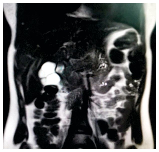
Fig 3: T2WS MRCP Coronal image demonstrating partial intrahepatic Gallbladder