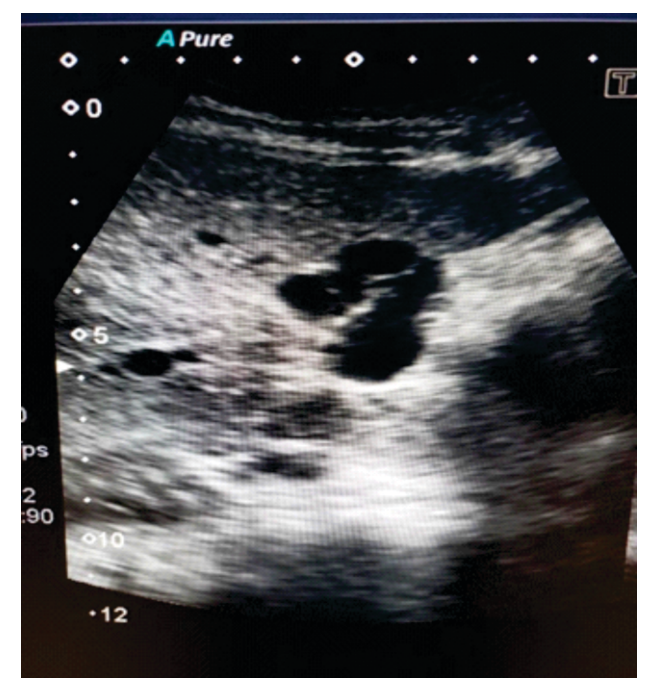
Fig 1: Transabdominal USG image showing partial intrahepatic Gallbladder. Few internal septations can be seen in the intrahepatic part

Considering the rarity of its incidence and the unusual location, the intrahepatic gallbladders may pose a diagnostic challenge and may complicate surgical interventions. Thus, making it mandatory for the surgeon to know the ectopic location beforehand to avoid any intraoperative mishaps.