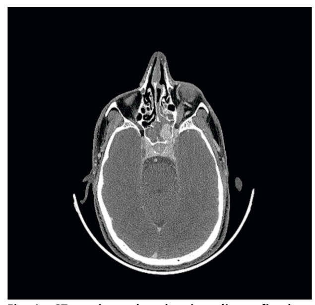
Fig 1: CT angiography showing direct fistulous communication of the left internal carotid artery with cavernous sinus as well as aneurysmal bulge into left sphenoid sinus. Early draining of left ophthalmic veins with proptosis and prominent collaterals on left temporal region of the scalp

discharged. Over time he developed left-sided reduced visual acuity along with repeated episodes of nosebleeds. Nasal packing and electric cauterization were done for intractable epistaxis, however, it remained resistant to treatment. Detailed physical examination revealed left sided proptosis, diplopia, chemosis, and congestion along with left sided ocular bruit and reduced visual acuity in the left eye. He underwent CT angiography head (figure 1) which revealed an