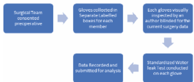
Fig 1: Diagrammatic Prestructured Format of Data Collection

After complete analysis, the data regarding perforations for each glove was recorded in terms of a number of perforations, the location of each perforation (in terms of Left or Right hand and the digit involved) and the layer of glove perforated. This data was related to the type of surgery and the surgeon/assistant surgeons/ scrub nurse. These comprised the study variables.