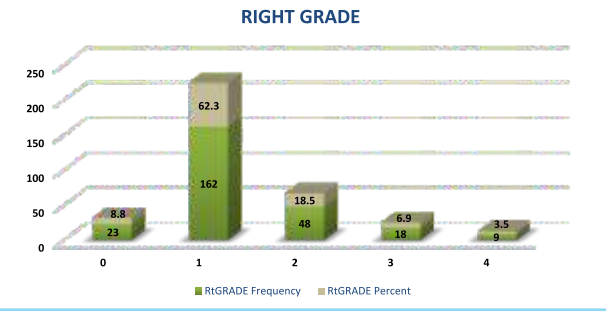
Fig.1: Frequency distribution of Renal Parenchymal Disease grades in right kidney